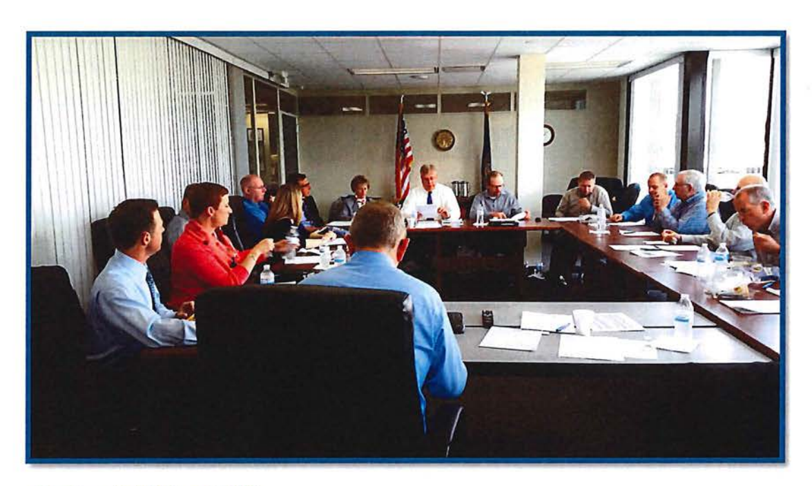
Meeting with NDBF and FDIC

As of 6/30/16 Nebraska had 83 Money Transmitters.