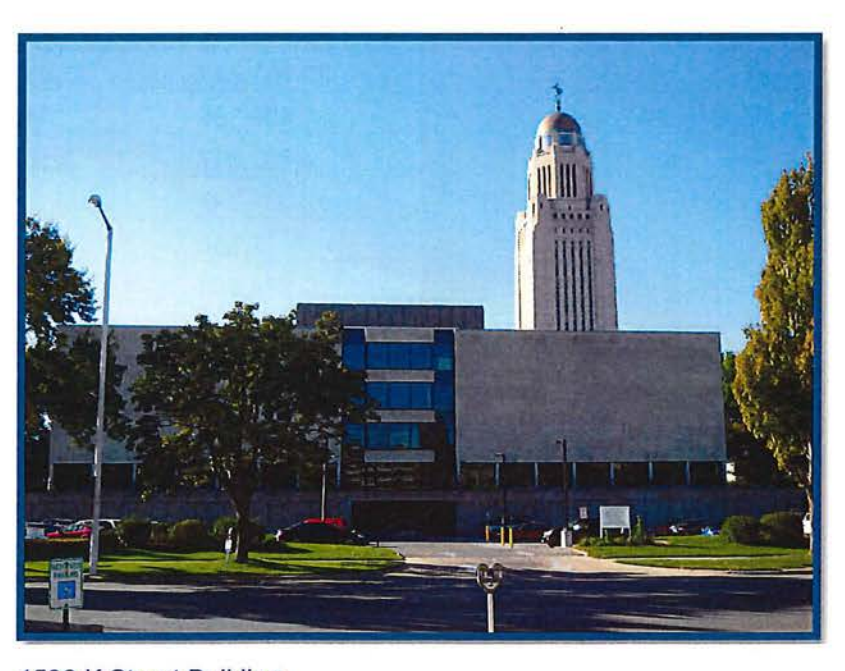
1526 K Street Building